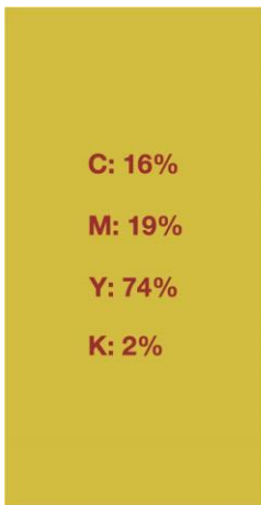
#d2bd40 PANTONE 7758 C