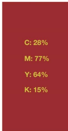
#9b2d30 PANTONE 704 C